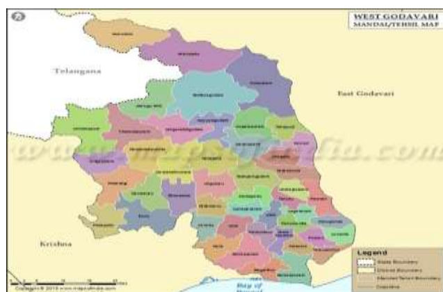
Figure 1: Location of mandals in westgodavari district.